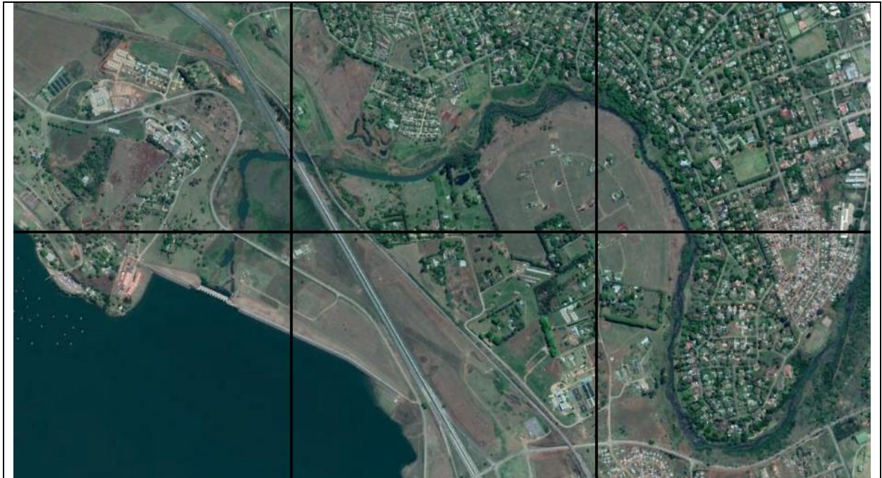
Figure 3: Aerial Photograph

2.1 Refer to Figure 3 below and the Fact File. Answer the questions that follow.